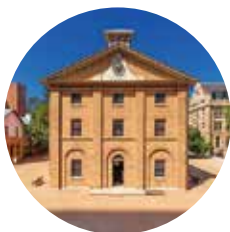
Hyde Park Barracks Museum