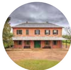
Rouse Hill House & Farm