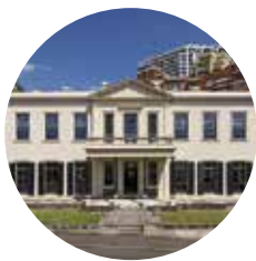
Elizabeth Bay House