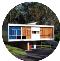
Rose Seidler House