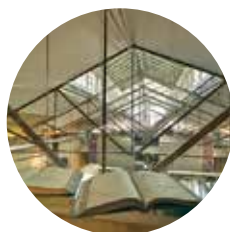
Caroline Simpson Library & Research Collection