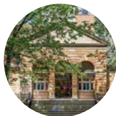
Justice & Police Museum